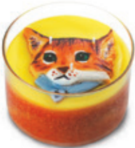
Demerti the Cat