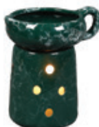
Hunter Green Marble