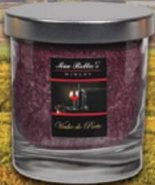
Vinho do Porto

MSRP $19.95 each $59.95 set of 4 USD MSRP $24.95 each $74.95 set of 4 CAD Net wt 8 oz, 225 g