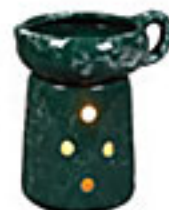
Hunter Green Marble