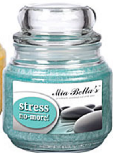
stress no-more For tranquility & relaxation!