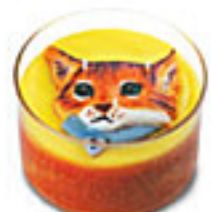
Demetri the Cat