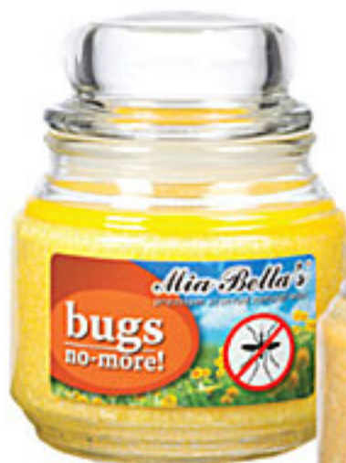
bugs no-more Rid patio of unwanted pests!