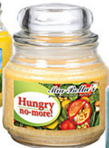
hungry no-more Complement your diet!