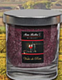
Vinho do Porto