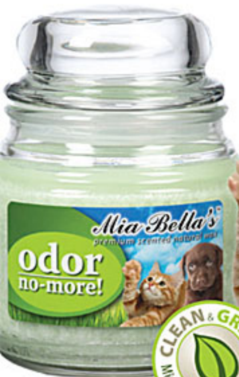
odor no-more Mask unwelcome odors!